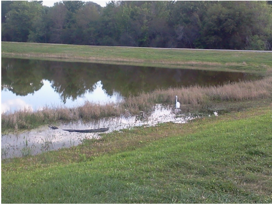
2014-03-20 17.34.45 lake 55.1'