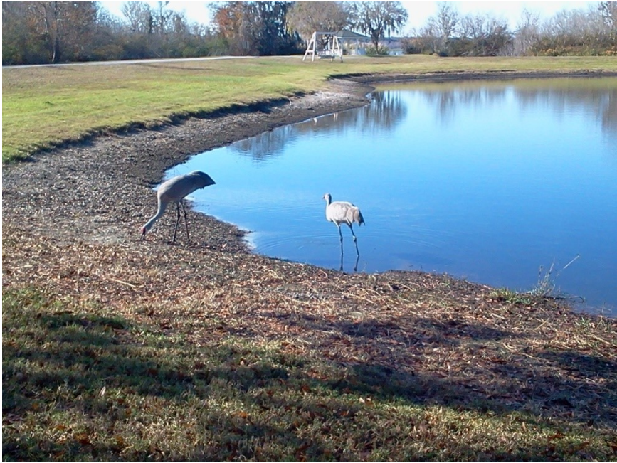
2017-01-05 14.55.13 lake 54.9'