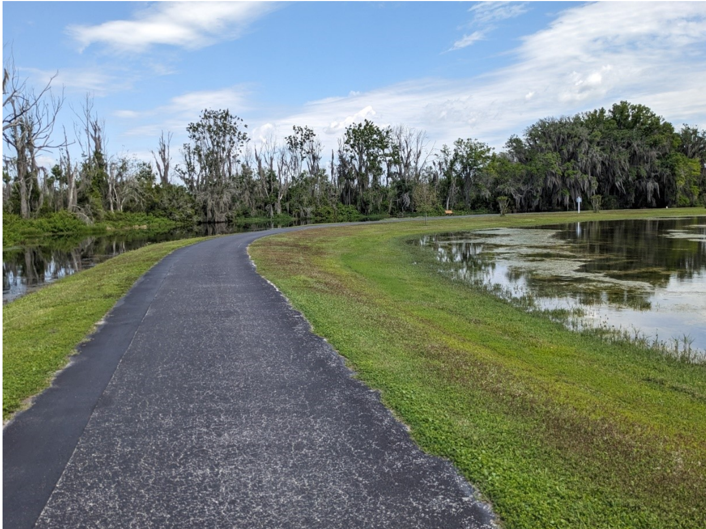
PXL_20240328_174757873 lake 57.28'