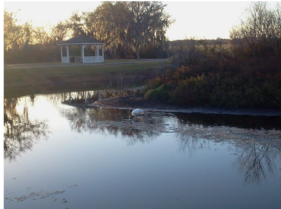
2017-01-12 17.18.04 LAKE 54.9'