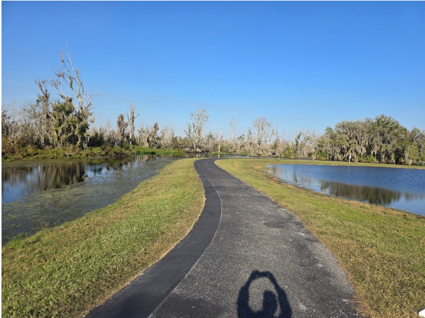
20241220_151812 lake 57.47'