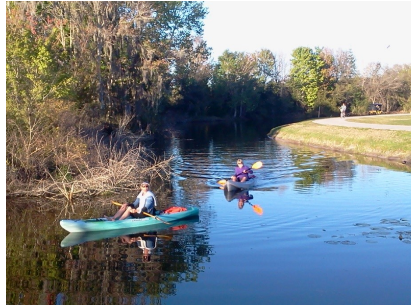
2014-03-01 17.30.16 Lake 55.1'