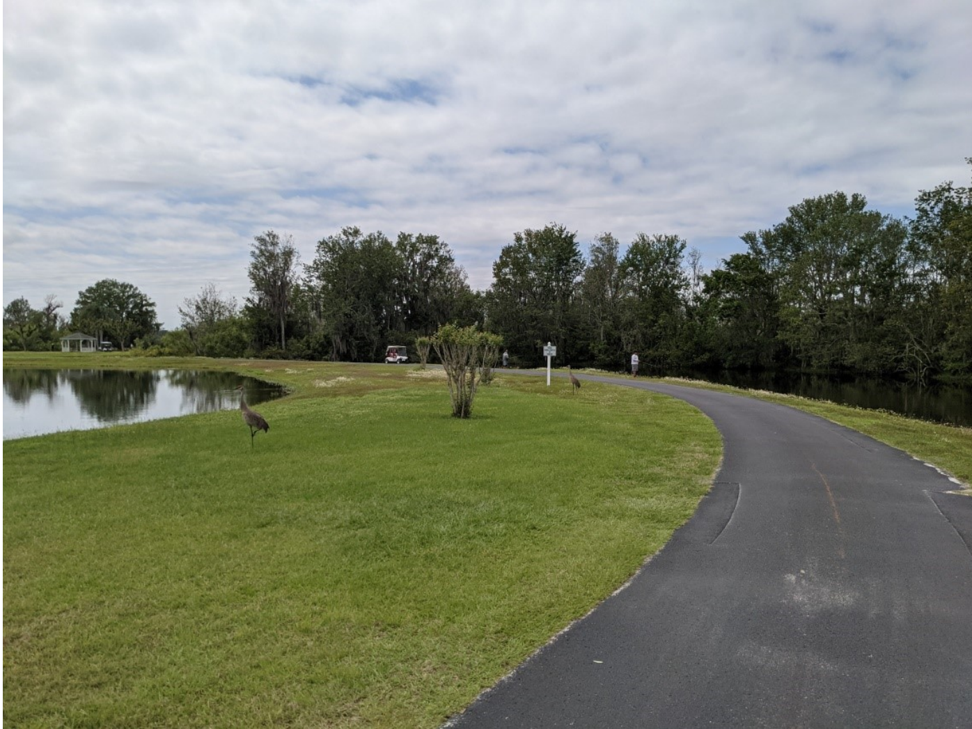
PXL_20210401_185616759 lake 57.1'