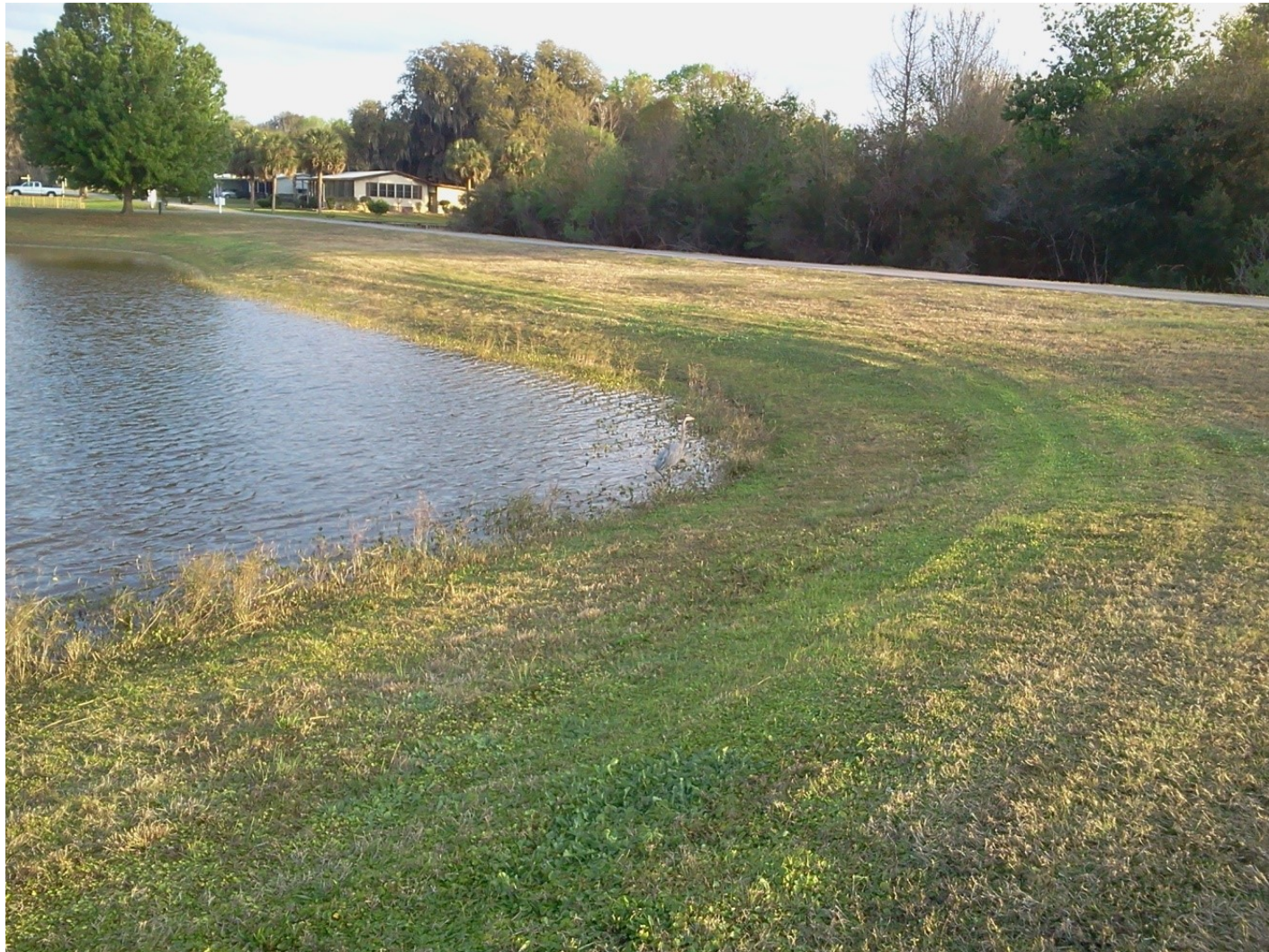
2013-02-10 17.21.02 lake 54.6'