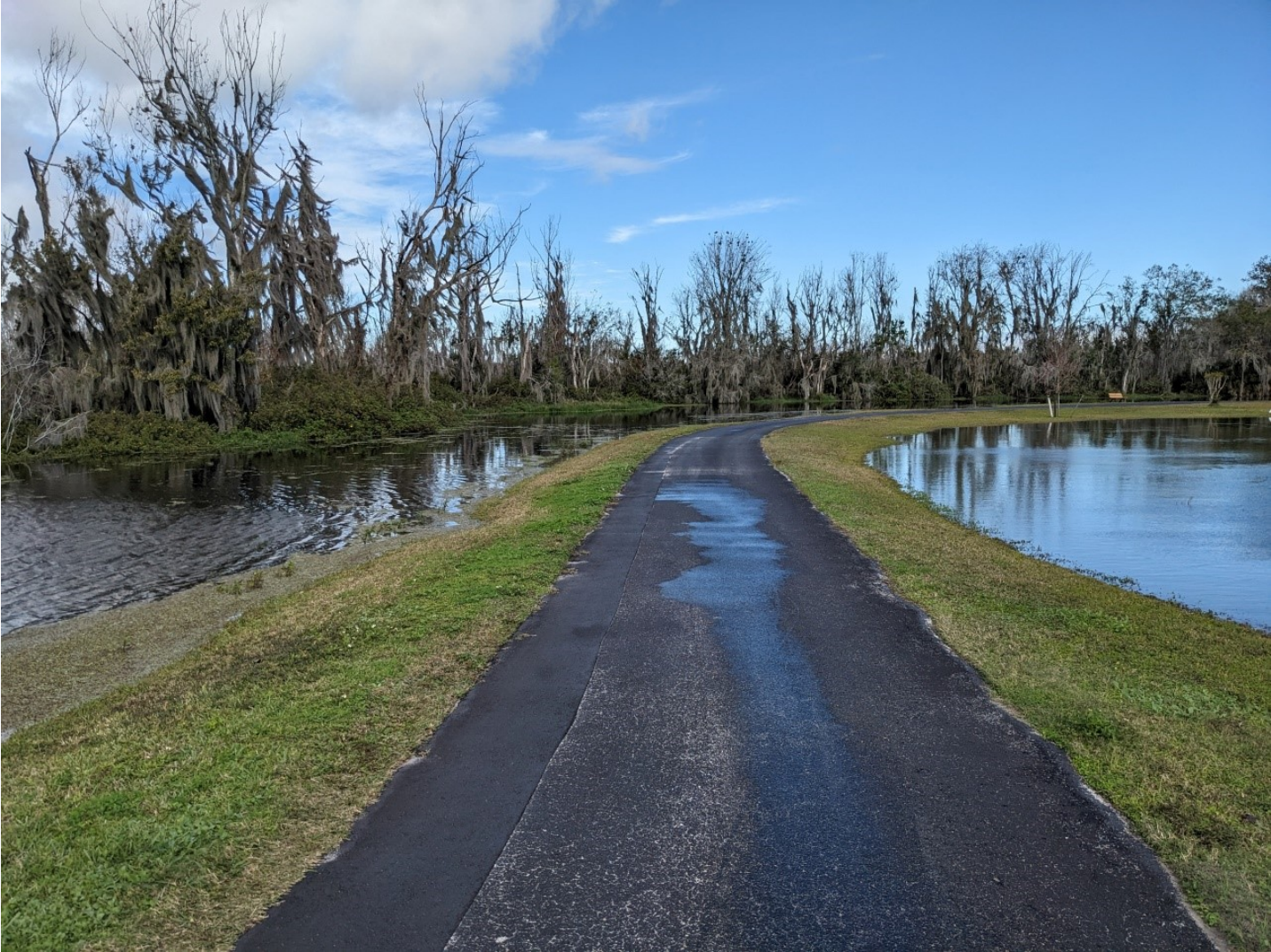
PXL_20231217_171131561 lake 57.48'